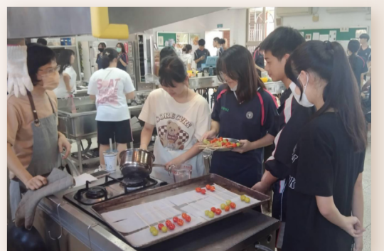
▲ The teacher guides students to make desserts during the club time in the home economics classroom.

On Wednesday afternoon, by making delicious food and chatting happily with your friends for two hours, students will be able to immerse themselves in the joy. Furthermore, the home economics classroom supplies students with so many kitchen tools, such as flavorings, knives, baking trays, and various pots and pans, that club members only need to bring their own ingredients.