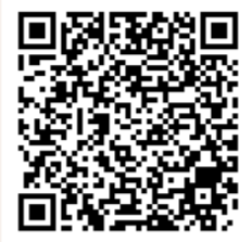
◀ Taiwanese taekwondo athlete Su Bo-Ya competing against Korean rival wins a gold medal in 2018 World Taekwondo Grand Prix. (https://ssur.cc/BC3GA6g)