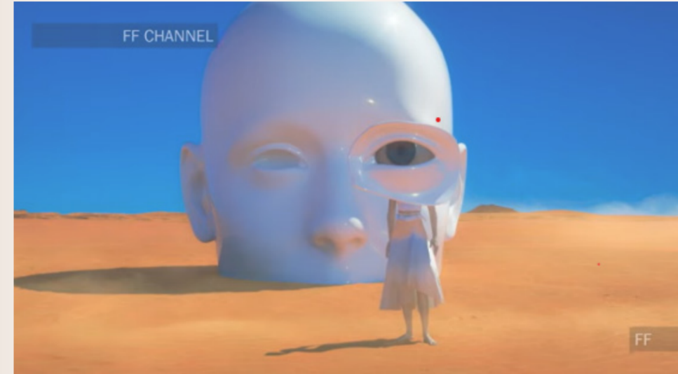
▲ The digital film uses a giant surreal space, with individuals wearing various forms, paired with giant human body parts, and the protagonist staring at each other. https://yt1.piee.pw/59zhu3