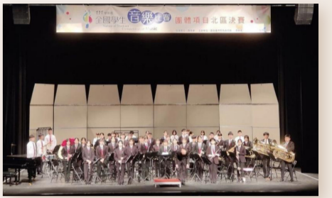
▲ Pingjen High School Wind Band participates in the grand final of the National Student Music Competition.

The National Student Music competition was held on November 28, 2022, at the Huashan (華山) Cultural and Creative Park in Taipei City. Musically talented individuals from all over Taiwan will gather for a passionate performance.